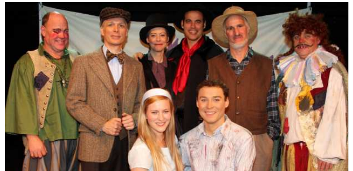
Cast of The Fantasticks

I have worked on many plays in the past, but there are not many about which I can say that I was sad when the run finished - The Fantasticks is in that category. It's not just the content of the play, but the music, the actors, and of course the whole team that brought to life a dialogue and score, turning both of these into something that was amusing, heart warming, poignant, and a pleasure to listen to and watch.